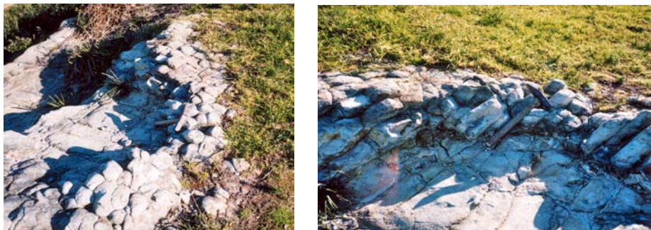
Figure 2 Columnar Sandstone at La Perouse, opposite 1589 Anzac Parade, 2009

This feature can still be seen on a high point outside of, and to the east of, 1589 Anzac Parade at La Perouse (Lat, Long. -33.987127, 151.233822 [Figure 2], although this outcrop is not as impressive as that described by Hunter.