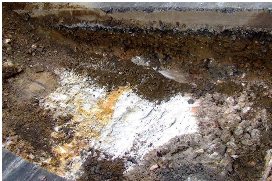
Figure 4 A weathered igneous dyke in a trench outside of 1585 & 1587 Anzac Parade, La Perouse – 29 March 2010

It was not numbered but it does align with, and may be an extension of, n° 45 on the coast (now St Michael's Golf Course) and may be an extension of that.