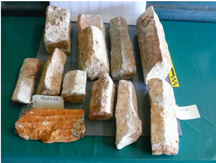
Figure 1 Columnar sandstone specimens from the wreck of the Boussole at Vanikoro Musée de l'histoire maritime de la Nouvelle-Calédonie, Noumea

Almost two centuries later, during the 1981, 1986 and subsequent underwater excavation campaigns at Vanikoro Reef (Solomon Islands), blocks of columnar sandstone were found on the site of the wreck of the Boussole , and some were retrieved and stored at the Noumea Maritime Museum [Figure 1]. 5 Tests carried out by the Noumea Public Works Laboratory in 2003 suggest that these specimens came from Botany Bay, the only location on the route that Lapérouse took where that comparatively rare feature exists.