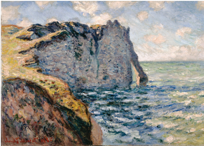
Claude Monet, The Cliff of Aval, Etréat .

https://www.franceculture.fr/emissions/la-compagnie-des-auteurs/la-mer-dans-la-litterature#xtor=EPR-2-[LaLettre27062019]